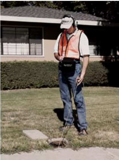
Touch the tip of the rod on the brass shut off valve.

3. Water leak surveying at meters is often performed using a Long Contact Rod: