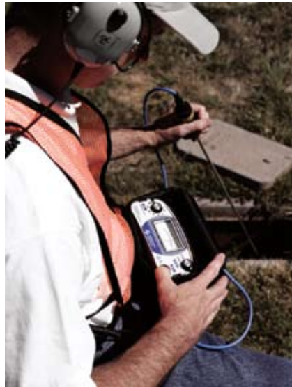
Listen and use the meter display to compare the loudness at different locations.

4. Use your hearing and the meter display to determine exactly where the leak sound is the loudest: