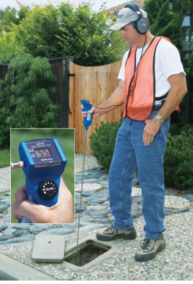
Listening at a Hydrant Listening at a Meter with with a 4-inch Rod Optional 40 inches Rod

2. The LD-8 includes a 4-inch short contact rod, a 4-section contact rod set (threaded connections, each rod 13 inches) and an adapter rod as standard items: