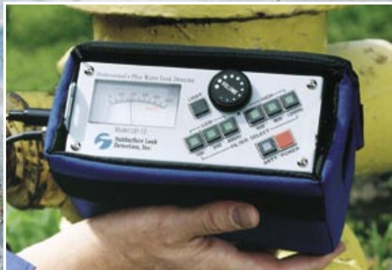
Ground Miking with the LD-12 to Pinpoint the Leak